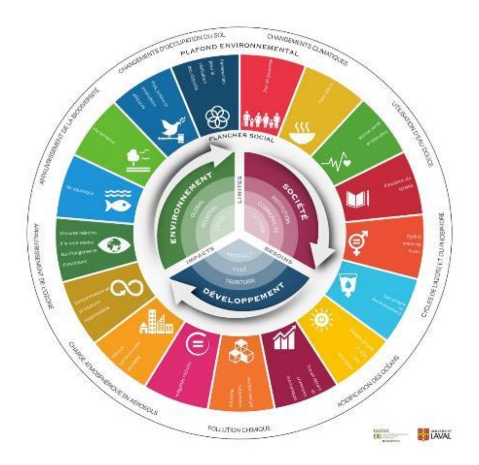
Figure 3. Conceptual scheme of the EDS Integrated Approach

For this reason, we have found the relevance of using a simplified representation to communicate the complexity of this new common challenge. In order to facilitate the diffusion and appropriation of this three approaches, we conceived a conceptual diagram to present them in an integrated way: the conceptual scheme of EDS-IA (fig. 3). At the center of the scheme, the "ideation engine" contains the notion of scale, essential in the operationalization of sustainable development. Around, a donut circumscribed internally by the "social floor" and externally by the "environmental ceiling", represents the 17 SDGs. This graphic is used in training and research activities to analyze existing initiatives and imagine new ones by mobilizing all the information contained in each portion of the wheel in an integrated way.