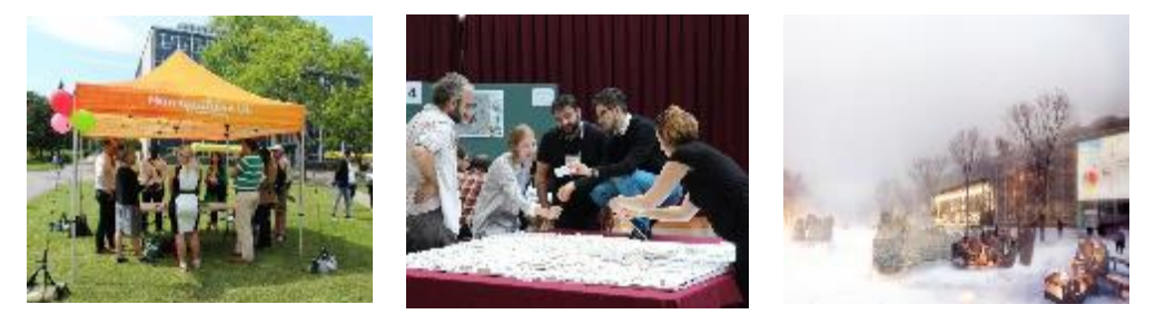
Fig. 5 Summer school "Inhabiting a Nordic campus: let's imagine our future in a living laboratory

The cycle of the first year of the EDS-IA implementation culminated in the completion of a three-day summer school in August 2017 during which about fifty participants proposed projects to transform the campus into a "living laboratory". This last event of the cycle focused on ideation, and built on the results of the two previous steps. During the first day of the summer school, the participants traveled the campus to meet with representatives of administration and services units who inform them on the challenges of the existing services (energy, housing, catering, transport, etc.). Such collaboration with the staff and authorities of the university was the result of the work done in the previous stages. At the end of the event, participant have formulated seven projects to transform the campus into a living laboratory by promoting the achievement of the SDGs for its users (Fig. 5).