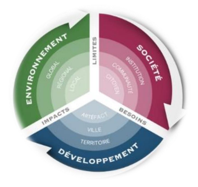
Figure 2: The "ideation engine"

In the "development" pole, we need to consider all artefacts, goods and services produced to meet the needs of society. It goes from consumer goods, to the planning of territories, through that of cities. Regarding the environment, we must consider the links between ecosystems and the impacts of human actions on natural cycles, from local to global. In order to tackle all these aspects, it is necessary to mobilize many disciplines around a given object of analysis. It is through this "interdisciplinarity in practice" (Hufty, 2011) that this approach contributes to a better understanding of multiple issues related to sustainable development and encourages the emergence of new solutions. This is what we call the "Ideation Engine" (fig. 2).